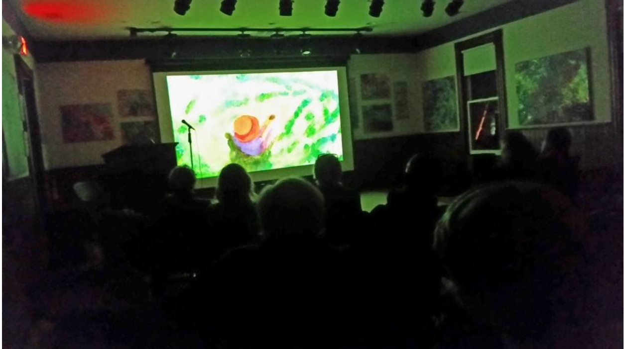
Community members gathered to watch Dirt! The Movie in Sumner Hall.