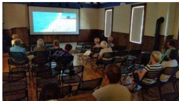
Community members gathered to watch Blue Gold: World Water Wars in Sumner Hall.